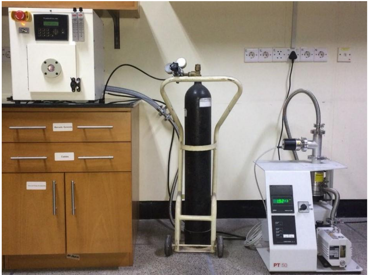
Setup of the PE-50 Plasma Etcher