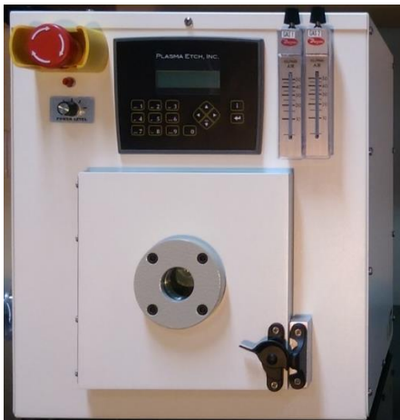
PE-50 Plasma Etcher

The plasma etching is a dry etching process whereby the surface material is removed by plasma processes at low pressure. The PE-50 plasma cleaning system can use up to two gases simultaneously to clean and modify the surface. The type of the active gasses and their ratio is selected depending on the type of material to be etched. The optimum and uniform processing results are obtained when the gas flow rates are selected to maintain the vacuum in the plasma processing chamber in the range of 0.15 to 0.30 Torr. The RF power capability of the plasma etcher is 100 watts which is carefully chosen to avoid the excessive temperature rise in the sample being etched. Active ion species are accelerated towards the sample surface where the adsorption and desorption reaction takes place and the volatile reaction products are exhausted by the vacuum pump.